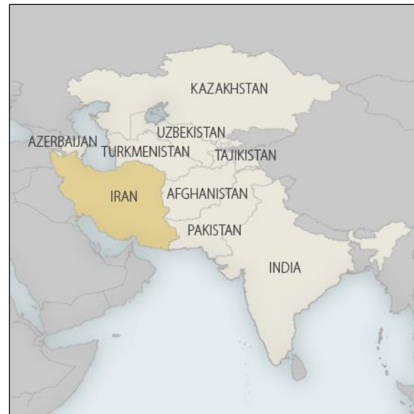
Figure 4. South and Central Asia Region

Most of the Central Asia states that were part of the Soviet Union are governed by authoritarian leaders. Afghanistan remains politically weak, and Iran is able to exert influence there. Some countries in the region, particularly India, seek greater integration with the United States and other world powers and tend to downplay cooperation with Iran. The following sections address countries that have significant economic and political relationships with Iran.