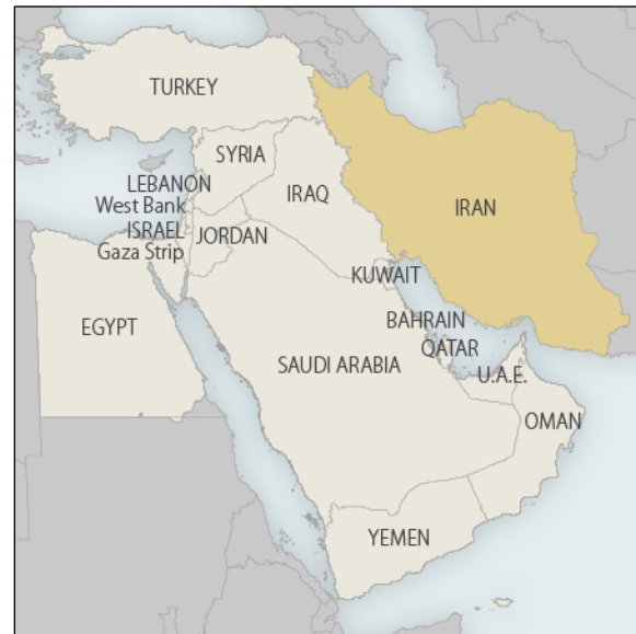
Figure 2. Map of Near East

The willingness of Qatar, Kuwait, and Oman to engage Iran contributed to a rift within the GCC in which Saudi Arabia, UAE, and Bahrain—joined by a few other Muslim countries—announced on June 5, 2017, an air, land, and sea boycott of Qatar. 53 The rift has given Iran an opportunity to