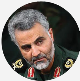
IRGC Major General Qasem Soleimani