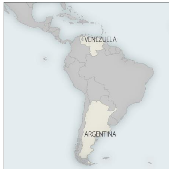
Figure 5. Latin America

Some U.S. officials and some in Congress have expressed concerns about Iran’s relations with leaders in Latin America that share Iran’s distrust of the United States. Some experts and U.S. officials have asserted that Iran has sought to position IRGC-QF operatives and Hezbollah members in Latin America to potentially carry out terrorist attacks against Israeli targets in the region or